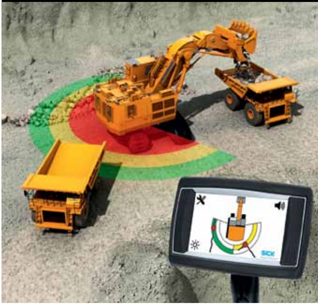
Figure 3: MINESIC100 EPS provides collision awareness for large excavators

application software uses the mounting position, excavator size, tail swing radius, safety margin, truck spotting radius and maximal loading area for detecting and processing object information such as position and size. As a result the system only warns actively for obstacles on a collision path, without the necessity of tagging the object or infrastructure before. Therefore, collisions between the excavator and the highwall face in a limestone quarry can also be avoided at the same time.