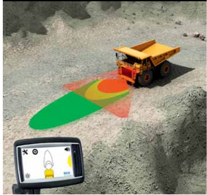
Figure 4: MINESIC100 TPS monitors two critical areas in front and behind the truck and alerts the driver if required

The MINESIC100 WPS is a highly-precise collision awareness system for infrastructure obstacles. Embankments and stockpiles present a considerable collision risk. When loading and unloading, wheel loaders are continuously moving forward and backward, while the main attention of the operator is focussed on the bucket. The MINESIC100 WPS monitors the critical zones within the rear section of the vehicle (see Figure 5). The system sends a warning signal when there is a risk of collision and provides assistance to the operator during difficult manoeuvres.