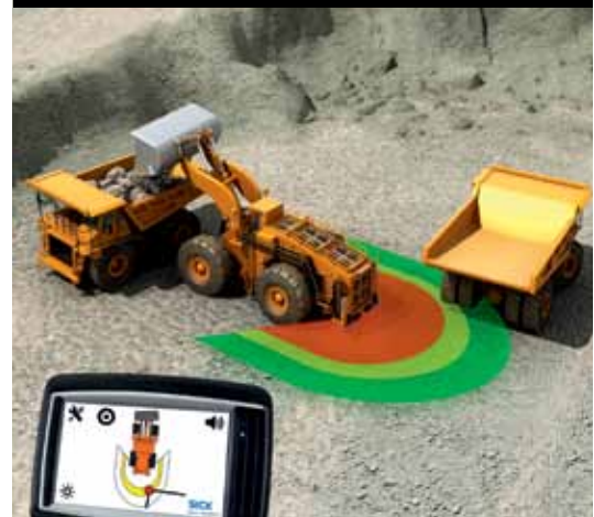
Figure 5: MINESIC100 WPS monitors critical zones in the rear section of the vehicle

Many quarry operators worldwide trust in MINESIC100's guidance and awareness solutions to prevent collisions in dangerous areas. The use of this technology results in reduced downtime and repair costs by guaranteeing high machine availability and trouble-free operation. The active situation-dependent warning with low false alarm rates helps to detect and track moving and stationary obstacles without the need for RFID tags. The integrated black spot warning (geo-fencing) for hazardous areas and an integrated installation wizard simplifies installation and operation. Self-diagnostic functions make system maintenance easy, enabling the operator to stay focussed on the main task. ■