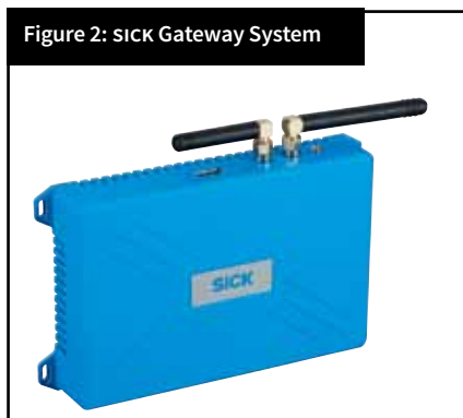
Figure 2: SICK Gateway System

To support drivers in critical situations, SICK has designed special guidance and collision awareness solutions: MINESIC100. These driver assistance systems usually comprise one or multiple Light Detection and Ranging (LiDAR) sensors for environmental sensing around the vehicle, a GPS system for location and speed information, cabling, evaluation unit with operator display and advanced software for situation-specific warning strategies and visualisation.